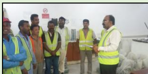
DREAM READY MIX