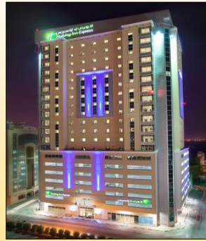
Holiday Inn Express Hotel

I Pest Control continues its growth by winning multiple contracts with Holiday Inn Express Hotel, IBIS Hotel and All Geant Hypermarket.